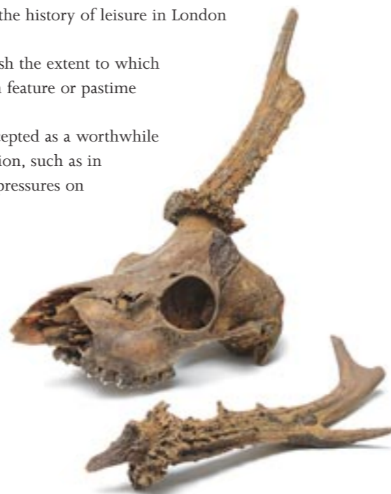
Fig 38 Roe buck skull and antler; sawn-off antler tines can be an indicator of medieval boneworking industries

define the nature and extent of different neighbourhoods – in social, economic, ethnic and religious terms