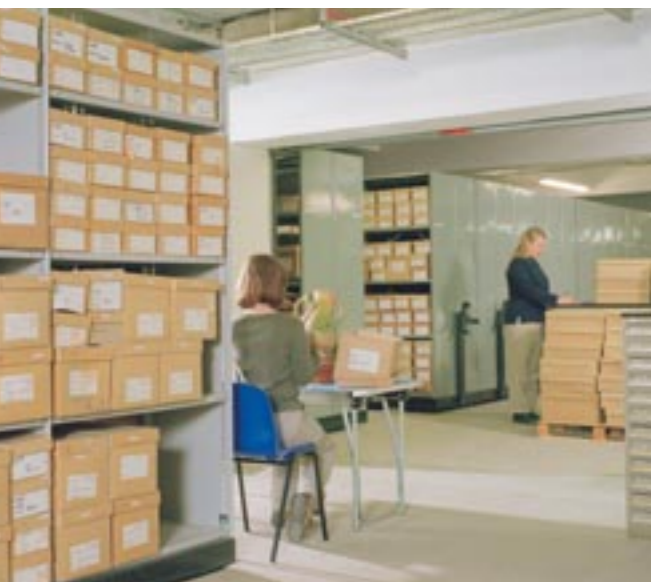
Fig 40 Researchers using the newly opened LAARC in February 2002

This Research framework is based on the premise that it is only by embracing the size, complexity and potential of the recorded resource that its value can be harnessed. In London, the focus has shifted from the desperate need to record sites before their imminent destruction (a very real dilemma in 1972) to the need to study, analyse and publish results, without which the efforts of the excavators would arguably be wasted. In the 21st century, the greatest advances in our knowledge of London's past are expected to come not from new sites, but from the curated archive, through a concerted programme of study and publication. This is not to say that no new, unexpected discoveries will be made in the course of current and future phases of evaluation, assessment and archaeological intervention: archaeologists are trained to expect the unexpected. Rather, it is the sheer scale and weight of hitherto unpublished data that has the potential to drive a research programme with a far greater momentum and with truly surprising results. For most people, 'archaeological research' is synonymous with excavating sites: in London it must become synonymous with excavating archives too.