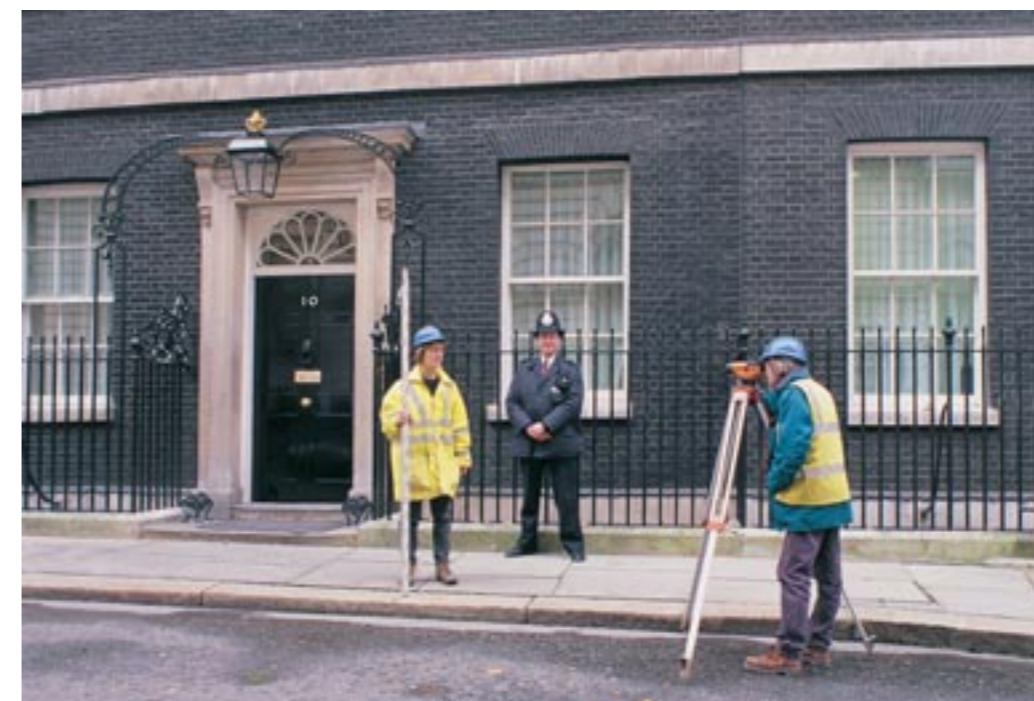
Fig 42 Surveying at 10 Downing Street, where part of Whitehall Palace, built in 1531, was recorded during the excavation of new rosebeds

Archaeological research in London therefore faces a dual challenge: firstly, to develop flexible systems that provide full access to the archives of interventions going back many decades – and to continue to evolve those systems, and secondly, to challenge and improve systems of recording and interpretation in light of results and the needs of London archaeology’s users. Many classes of data are recognised now (for example, undecorated coarseware body sherds, animal bones,