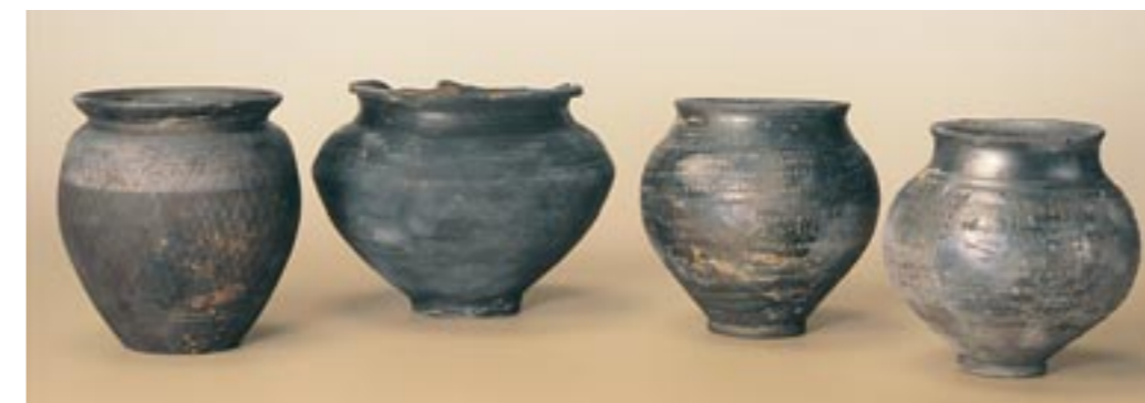
Fig 20 Products of the local Roman pottery industry at Highgate, north London

More work is needed to understand how crafts and industries were organised and functioned. The identification of industrial sites, in conjunction with integrated artefact studies, can address various aspects of craft and industry, including technological expertise, sources of raw materials, the influence of traditions, and market structure. Integrated examination of artefactual and environmental evidence, allied to land-use analysis, should be used to improve our understanding of industrial and craft production. Evidence of glassworking (Perring 1991, 52) and pottery manufacture (Drummond-Murray 2000) from sites in the area of the Upper Walbrook should be compared with Romano-British and Continental data on production and supply. The same approach can be taken with a range of industries related to food production, cloth-making and leatherworking.