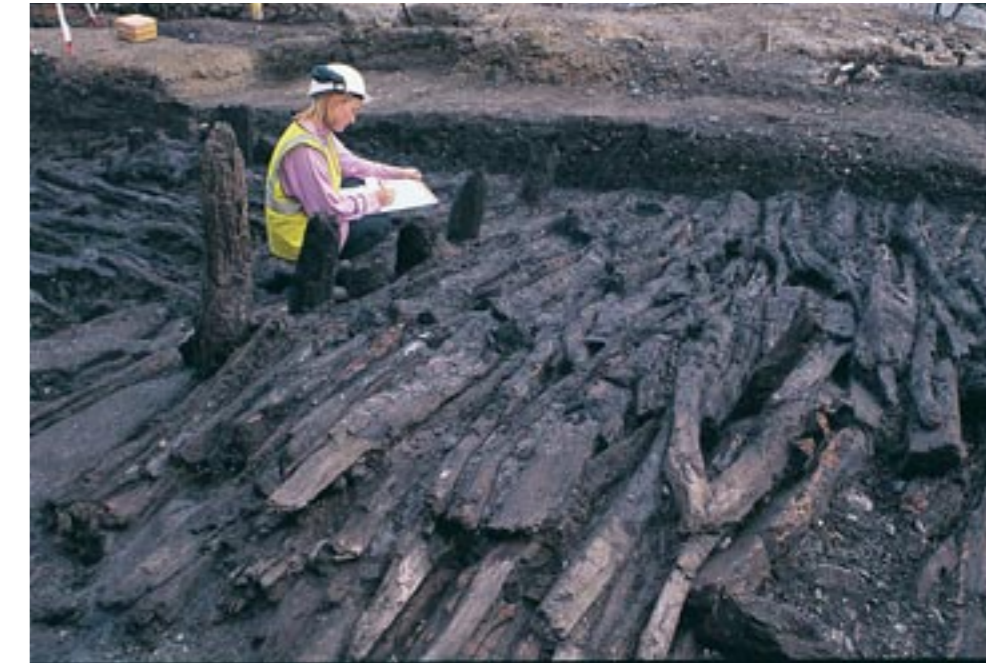
Fig 25 Timber platform dated to c 1045 found at Thames Court near Queenhithe

Social status is more clearly defined in terms of grave goods from early Saxon cemeteries and the variety of domestic cultural assemblages. The most obvious difference is between town and country. In the former there is growing prosperity throughout the period reflected in both the