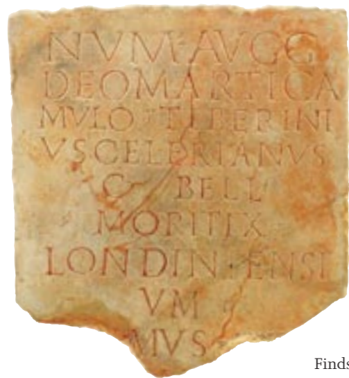
Fig 18 The 'Londiniensium' inscription, found at Tabard Square, Southwark, in 2002, translates as 'To the spirits of the emperors [and] the god Mars Camulos, Tiberinius, ranking moritex of the [traders] of London, set this up'. It is the only known inscription referring to London by name

Epigraphic evidence, particularly inscriptions from tombstones, and documents preserved on writing tablets, provide specific information on the identity and background of Roman Londoners.