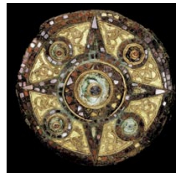
Fig 23 Saxon saucer brooch found at Floral Street in Covent Garden

Rural settlements of middle Saxon date are scarce in Greater London, as elsewhere, although this may be partly a factor of their generally undiagnostic finds assemblages. Topographical models, and the correlation of Roman and later road systems with parish boundary and tenurial evidence, place name evidence, documentary evidence (especially sites in Domesday) and archaeological finds may help to trace continuity predict the location of rural sites. Without a better sample of excavated sites and finds assemblages, wider questions of land use and economy remain difficult to examine.