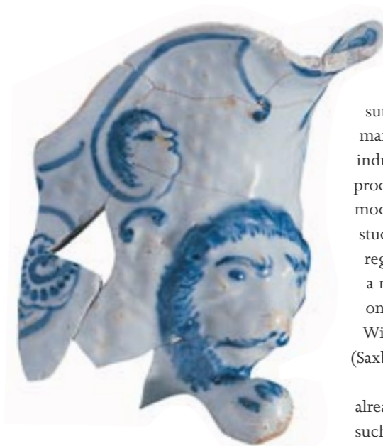
Fig 34 Moulded and painted 'lion's mask' from foot of saucelboat; from the Limchouse porcelain manufactory which operated 1745–8

its development. London's role as innovator, introducer and disseminator of technology, goods and ideas was of critical importance, and archaeology can both locate the sites where innovation occurred and study the technical processes used. What are the differences between the City and the surrounding area? Comparative studies are needed of the nature and scale of manufacturing in the City, its immediate environs – particularly the transfer of industry to Southwark – and the more rural, outlying areas. In researching production, archaeology should seek to distinguish between domestic or workshop modes and factories versus cottage industries. There is significant potential for the study of the development of specialised manufacturing centres across the London region. An example is the textile industry along the River Wandle at Merton, where a major centre for calico-printing and dyeing developed from the 17th century onwards, including water mills and other facilities, leading to the establishment by William Morris of a stained glass, weaving, printing and tapestry works in 1881 (Saxby 1995).