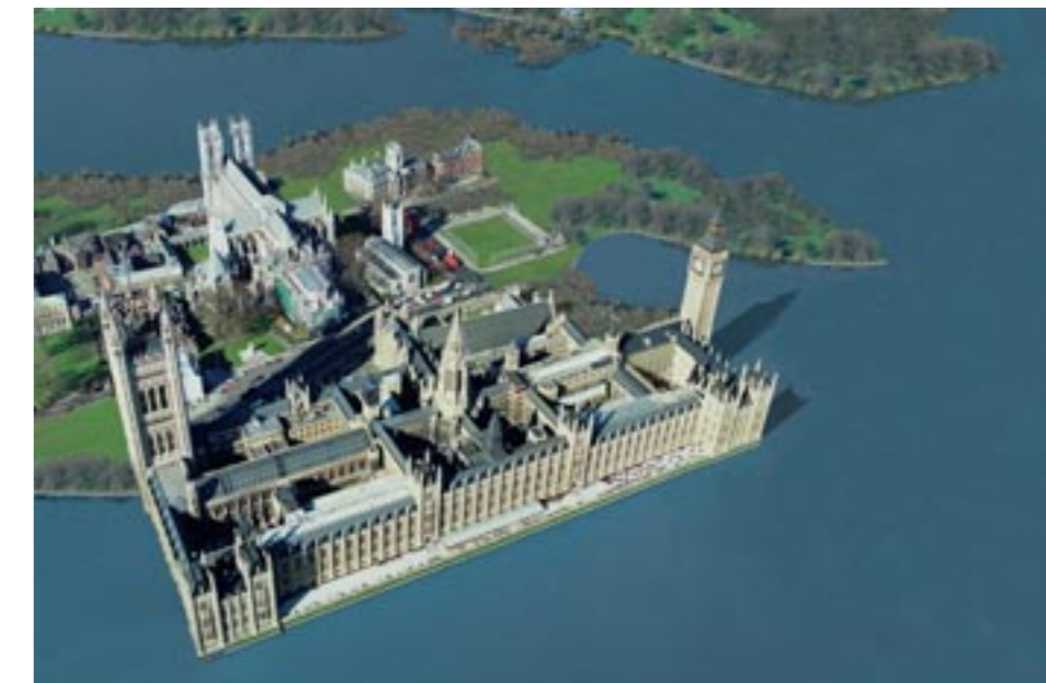
Fig 29 The Houses of Parliament and Westminster Abbey superimposed on Thorney Island, which may have been a focus for development in the Roman and Saxon periods

Archaeology's greatest potential contribution can probably be made to the better understanding of patterns of consumption. Historical records seldom allow a view of the materials that are 'consumed' within individual buildings or establishments. Many good archaeological assemblages have already been excavated and can provide high-quality data on relative wealth, status and class. The potential for identifying patterns of trade and distribution, of changing fashions, and of innovations in design or technology seems high. In London, building particularly