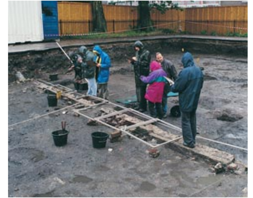
Fig 7 Teaching extra-mural students recording techniques at the Birkbeck College-MoLAS training dig

The implementation strategy is set within the three philosophical parameters described above, and is focused on delivery to all the users identified. Importantly, the strategy is founded on sustainability: mechanisms are described for reviewing, revising and regularly updating thoughts on the research themes, involving the collaboration of a wide range of researchers. In addition to the proposed regular review of the Research framework itself, as an umbrella document, a new series of widely disseminated bulletins entitled 'Research matters' will be a key tool in developing ideas on different research themes and evolving project proposals.