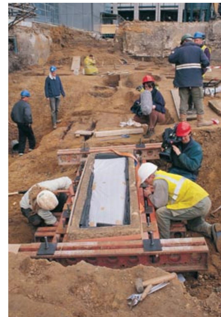
Fig 43 Preparing to lift the stone sarcophagus of the Roman lady found at Spitalfields in 1999

At a more detailed research level there are countless examples of how archaeological endeavour has advanced scientific and environmental research, sometimes in unexpected ways. Research into protecting archaeological remains has found a way to control asthma-causing house-mites and, through research on rock art, identified a new species of bacteria-producing antibiotic (Cassar et al 2001).