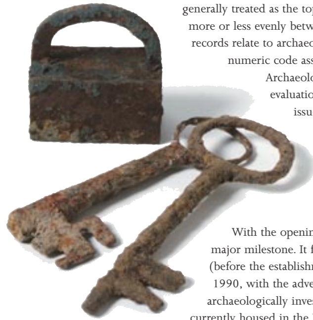
Fig 10 An iron padlock and rotary keys formed part of a remarkable assemblage of Tudor finds from More London Bridge in Southwark

generally treated as the top level of enquiry. The GLSMR includes 75,000 records, divided more or less evenly between archaeological sites and listed buildings: 14,000 of the records relate to archaeological sites, of which 11,900 have a site code (the unique alphanumeric code assigned to each new intervention). In 1999 alone the London Archaeological Archive issued 293 site codes for work ranging from small evaluations to complex urban excavations. A total of 320 site codes were issued in the year 2000, and 336 codes were issued in 2001. More recently, the work of the Thames Archaeological Survey has resulted in a baseline archaeological survey consisting of over 2000 records and 2000 images (Webber 1999).