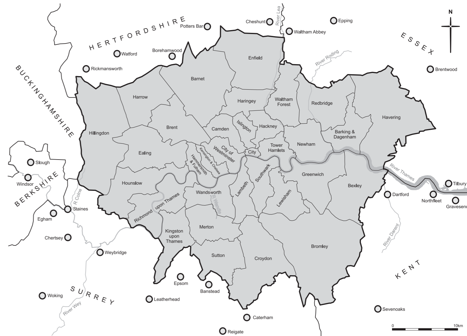
Fig 1 The boroughs of Greater London and the City of London

The LAARC takes as its definition of London the 32 boroughs and the City of London (Fig 1). The research questions and strategies outlined in this document are therefore primarily concerned with data contained within – or destined for deposition in – the LAARC.