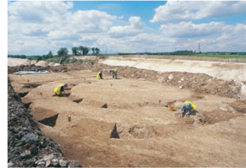
Fig 16 A Bronze Age double-ditch round barrow at Whitehill Road near Gravesend