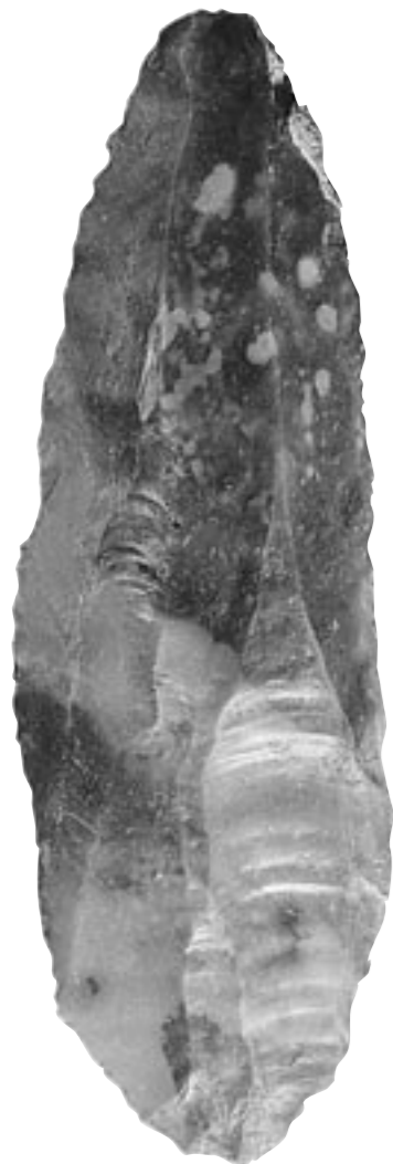
Fig 13 A Neolithic/Bronze Age blade knife from the Royal Docks Community School site in Newham