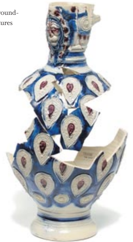
Fig 31 An elaborate 17th-century jug imported from the Rhineland, decorated with 'peacock eyes' and 'lion masks'