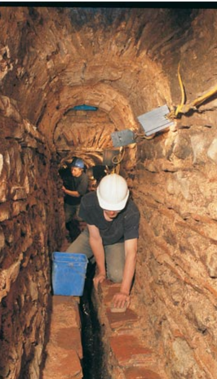
Fig 17 Investigating the Roman culvert which ran south from the forum area to the Thames, discovered at Monument House

This freeze-frame of life in frontier Roman London is arguably of comparable research value to the final occupation phase at Pompeii and Herculaneum destroyed in AD 79. Site archives also include many hundreds of structures and events from Roman London which have been precisely dated by dendrochronology, from an AD 47 drain beneath the main east–west road at 1 Poultry in the City of London (Rowsome 2000, 19) to an AD 294 construction of a palace by the usurper Allectus (Milne 1995, 75). Work on the archive and on future sites will reveal many more such structures, continuing the important development of chronologies and typologies for the settlement and for many categories of artefact.