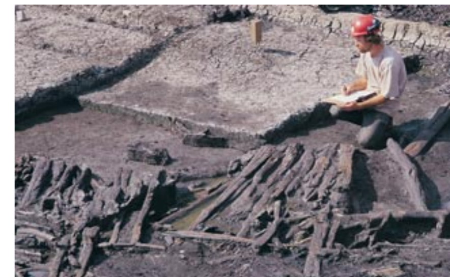
Fig 14 Recording a Bronze Age timber platform at Atlas Wharf, Tower Hamlets

The monument-dominated landscapes of the Neolithic and early Bronze Age were gradually incorporated into an increasingly organised and recognisably modern agricultural landscape given over to a subsistence economy apparently founded on a mixed farming regime. On the gravel terraces, co-axial field systems serviced by droveways and waterholes were laid out by communities who lived initially in small and latterly aggregated open settlements (eg Muckhatch Farm (Needham 1987; AGL 2000, 88) and North Shoebury, Essex (Wymer and Brown 1995; AGL 2000, 88)). These were accompanied, at any rate in the early part of the period, by flat-grave cremation cemeteries. A normative burial rite disappears in the centuries after 1000 BC. The role and status of late Bronze