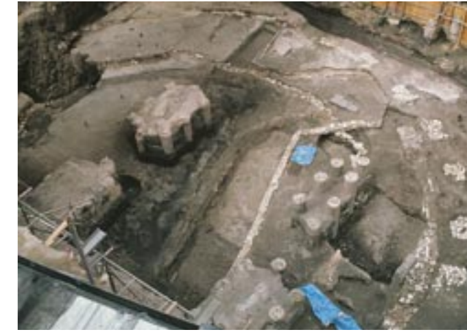
Fig 33 View of the Rose theatre, discovered on Bankside, Southwark, in 1989