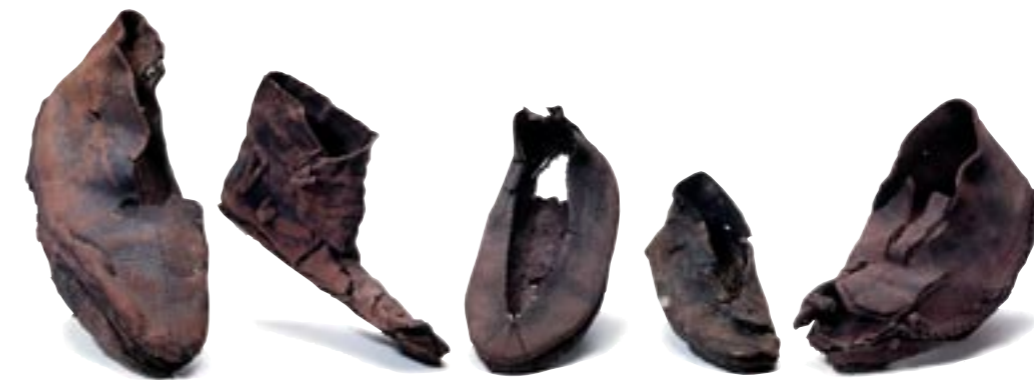
Fig 26 A group of late Saxon shoes found in 10th- and 11th-century rubbish pits at 1 Poultry

Religion played a particularly important role during this period but it is often understated in the archaeological record. There are few objects displaying either pagan or Christian iconography and little is known about early churches. Place names and documents provide some clues where to look but modern land use has tended to restrict investigation at these sites. Nothing is known of the first church, ancillary buildings or associated cemetery of St Paul's, or of the other potentially early church sites, either in the wic or the region. An important area requiring detailed appraisal is the location of early churches such as St Martin-in-the-Fields, St Bride and St Andrew, Holborn, found by Roman roads and just outside the city gates. The well-preserved deposits at Barking Abbey (MacGowan 1987) may aid the understanding of the more ephemeral remains at Chertsey, and permit comparison of these twin foundations.