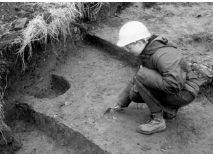
Fig 24 A sunken-floored Saxon building found at Tulse Hill School

served primarily for storage and other ancillary functions. Evidence of timber halls has also been found at four rural settlements, including Barking Abbey and the Treasury, Whitehall (AGL 2000, 186). Buildings in the urban areas were generally rectangular in plan. Relatively little is currently understood about functional specialisation at the building, neighbourhood and settlement levels, although some progress is being made as a result of the excavations at the Royal Opera House (Malcolm and Bowsher 2003) and with pre-Conquest buildings from 1 Poultry (Burch and Treveil in prep). To an extent this may be a factor of modern construction patterns and the limited number of wide-area studies in the wic. There are currently no archaeologically identified churches or other important administrative buildings from the period before 1000 and very few from pre-Conquest deposits.