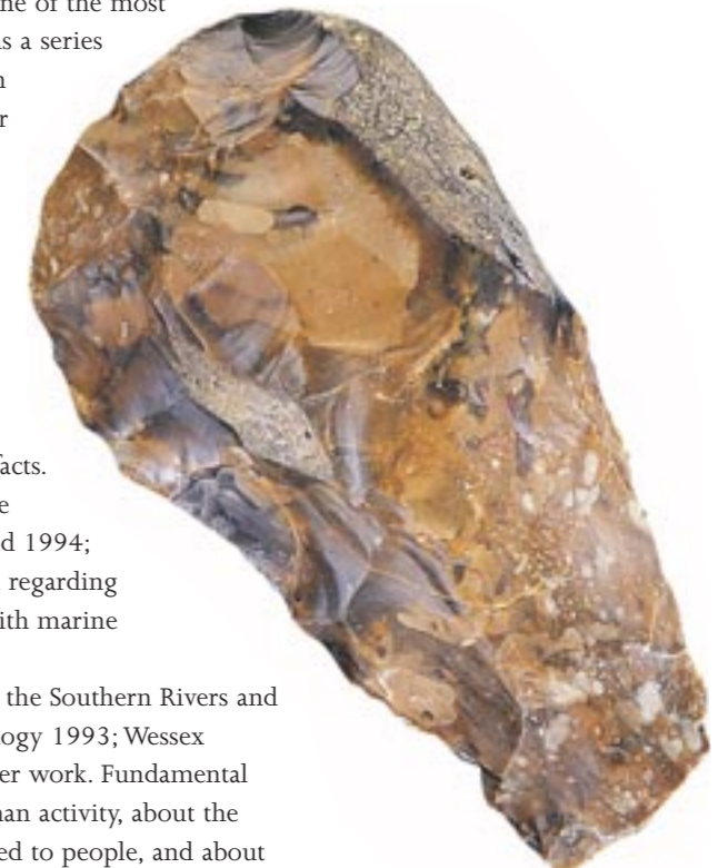
Fig 12 A Lower Palaeolithic pointed flint handaxe