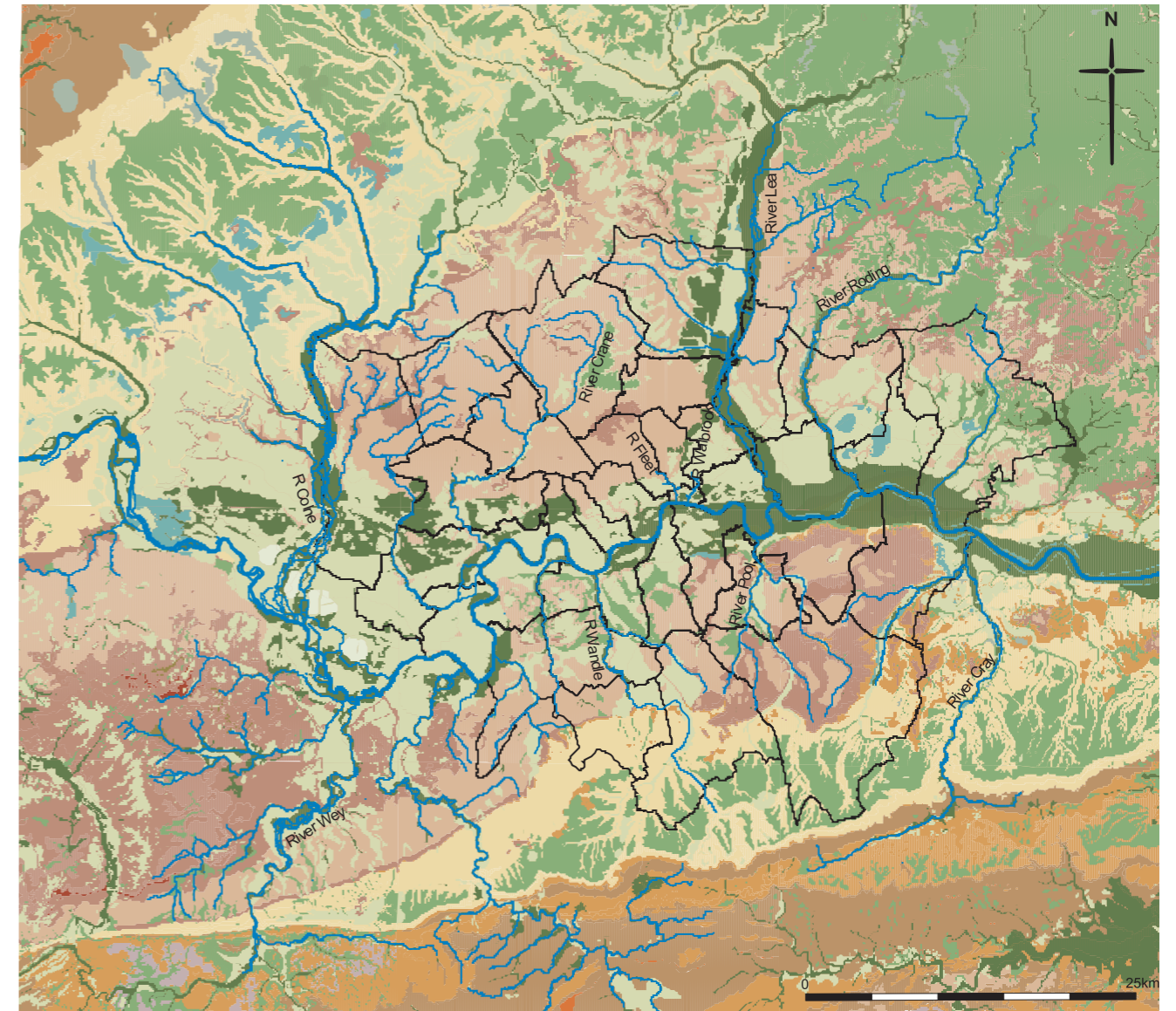
Fig 3 Drift and solid geology of the Greater London region (copyright British Geological Survey)