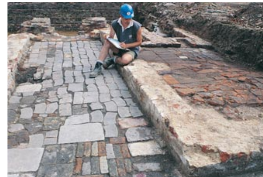
Fig 11 Recording a 19th-century brewery in Mortlake High Street – the oast-house floor contains reused refractory material from an 18th-century pottery

The key to encouraging more of this sort of collaborative work is seen as providing meaningful access to the archaeological archive. That is, not simply opening the doors to the archived material, but setting in place the infrastructure that allows people to explore and study that material. The Museum of London has embarked on a 'minimum standards' project, with funding from the Getty Foundation, which involves identifying and indexing all of the site archives held, and subsequently digitising this information for both on-site and remote computer access by individual researchers. This is part of the LAARC Access System, which is underpinned by the LAARC Management System (see Chapter 9).