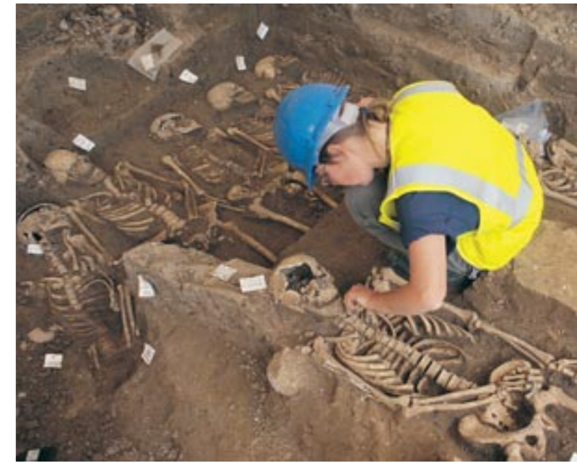
Fig 9 Recording medieval skeletons at Spitalfields

The recorded resource for London is biased: for a variety of reasons, the vast bulk of collected data and material relates to the very small geographical area that forms the historic core of London – the City of London, north Southwark and, to a lesser extent, Westminster. That bias has been addressed to an extent by the adoption of Planning Policy Guidance Note 16, Archaeology and planning (known as PPG 16), introduced in 1977 (DoE Circular 23/77), which substantially reinforced the treatment of archaeology as a material consideration in the planning process. PPG 16 (DoE 1990) has had an immense effect in terms of both the greater numbers of archaeological interventions and their wider geographical spread, with areas which had hitherto been overlooked now receiving routine attention. It is important to recognise developer-funded archaeology as 'a research activity with an academic basis, the aim of which is to add to the sum of human knowledge' (Wainwright 1978, 11, quoted in Thomas 1997, 138). Planning Policy Guidance Note 15, Historic buildings and conservation areas (DoE 1993), has had a similar though lesser influence for standing buildings.