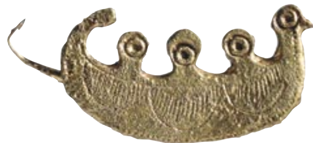
Fig 36 A 1st-century Roman brooch in the form of three men in a boat, with the prow in the style of a bird, probably imported from the Continent

In this document, five themes have recurred consistently throughout the period assessment: topography and landscapes, people and society, development and economy, and continuity and change. Unsurprisingly, these are themes which are in many cases being addressed through current and proposed research projects. Inevitably, there is some overlap between the themes. In this section, thematic objectives are given for each theme; examples and references to specific periods are generally avoided, as these appear in the preceding, period-based chapters. It is hoped that, in addition to the many current and proposed projects on researching aspects of London's archaeology, the focus on these themes, in the context of a research framework, will prompt their development and evolution and even their replacement with other themes as new priorities emerge. Initiatives such as the proposed 'Research matters' series, described below in Chapter 9, will enable researchers to actively take part in and shape the debate. The potential for collaboration and partnership between different individuals and institutions is clear, and might also lead to complementary research strategies involving different agencies.