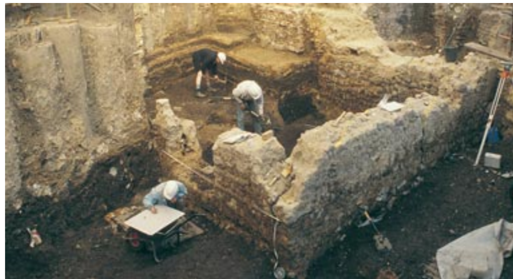
Fig 27 The late 11th-century parish church of St Benet Sherehog, Poultry

The evolution of religious ideology over the five centuries prior to the Reformation directly had an impact on places of worship, treatment of the dead, art and iconography. The London region contained an enormous collection of religious buildings (some 250 churches, over 30 religious houses, over 30 hospitals, 3 synagogues, and hundreds of private chapels (Knowles and Hancock 1971)). Of these, the larger monasteries are currently the best understood, and it is now possible to begin producing syntheses of their archaeology (Thomas et al 1997). The archaeology of the small and specialised religious establishments includes 'alien' cells (eg Ruislip), smaller hospitals (eg Kingsland) or double houses (eg Syon). The archaeology of the friaries of London (eg Austin