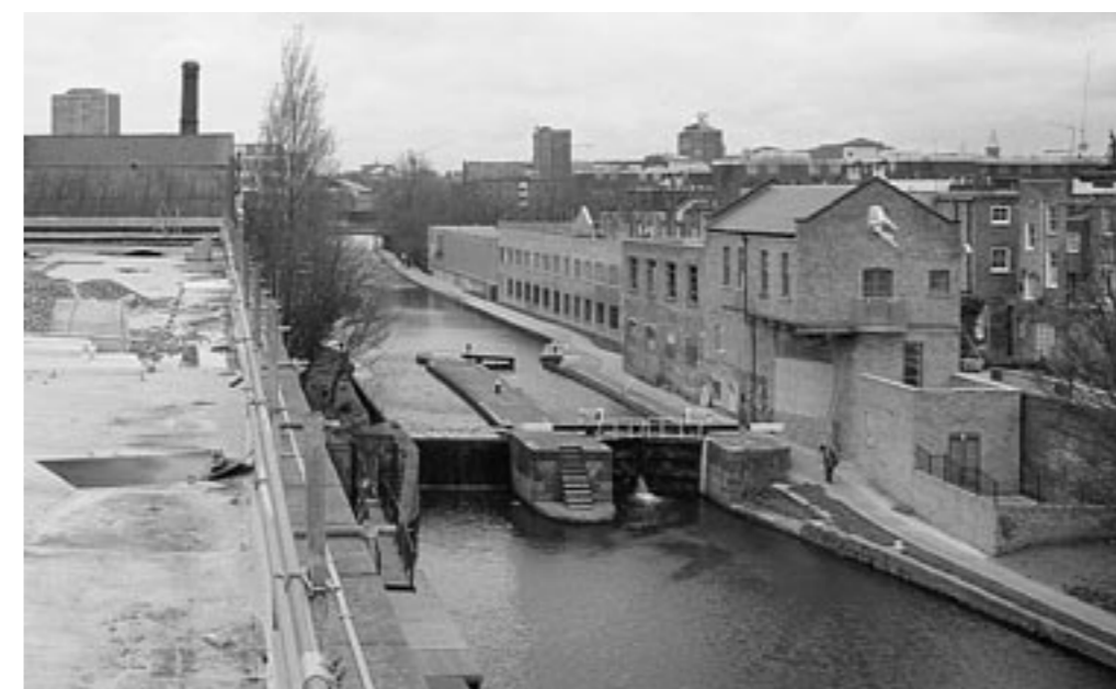
Fig 35 The Regent's Canal, connecting the Grand Junction Canal's Paddington Arm with Limehouse, was opened in 1820. View of the canal from Mortimer Wheeler House at 46 Eagle Wharf Road