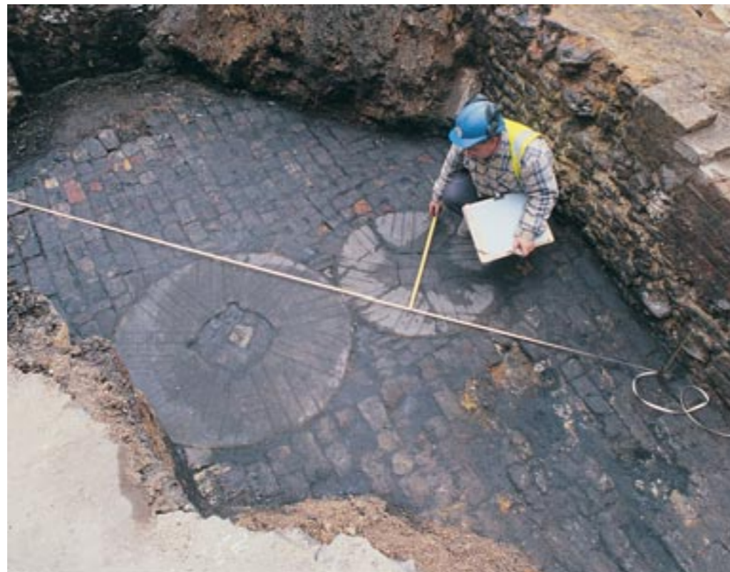
Fig 39 The floor of a Victorian flour mill which occupied the site of medieval Winchester Palace after the fire of 1814