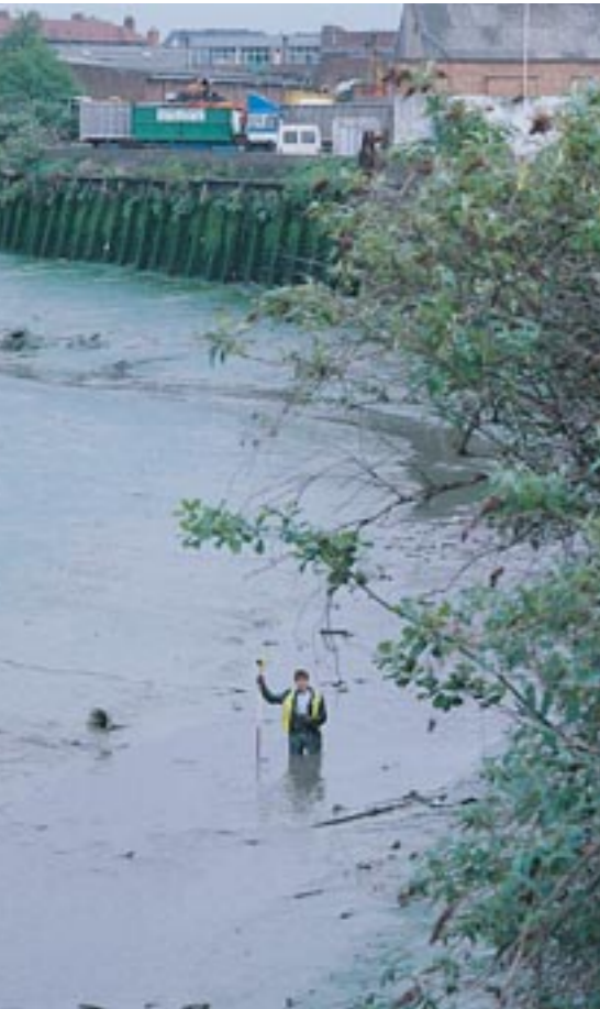
Fig 6 Surveying the tidal reach of Deptford Creek for the Environment Agency