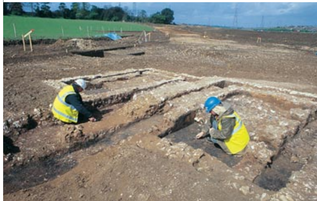
Fig 22 Excavation of a Romano-British brick clamp at Downs Road, Gravesend