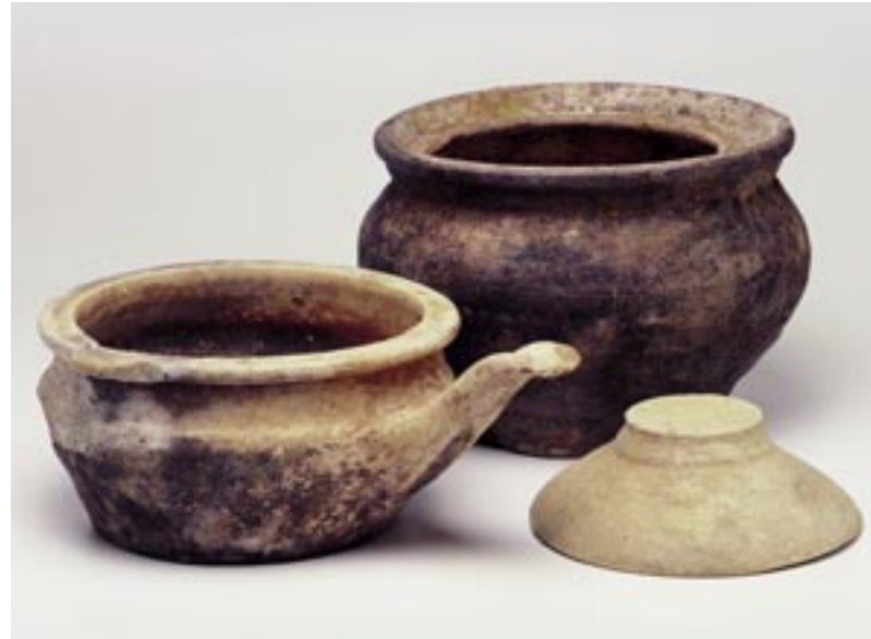
Fig 30 Fifteenth-century pottery from the Baltic Exchange site: a coarse border ware cooking pot, Cheam white ware pipkin and coarse border ware lid

on the last twenty years of research into medieval artefacts, but also considering the untapped potential of faunal and botanical remains, we should begin to pose questions that are not approachable in other urban centres where smaller amounts of material have been excavated.