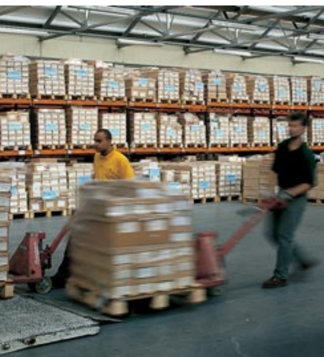
Fig 8 Moving the London Archaeological Archive into its new home at 46 Eagle Wharf Road

The quantification of the in situ resource is normally only tackled on a site-by-site basis, in response to development proposals. The London boroughs each have Unitary Development Plans, many of which incorporate archaeological 'constraint maps' showing 'priority zones' of presumed high archaeological potential and/or, conversely, zones where archaeological deposits are presumed no longer to survive. The best mechanism to update such maps is still a matter of discussion. While some towns and cities in England have developed Urban Archaeological Databases, with English Heritage's backing, there is no single, up-to-date, relational database – the Greater London Sites and Monuments Record (GLSMR) is an incomplete and quite limited record – used in the research and management of London's extant archaeological resource. There is a strong argument for producing updated maps showing the survival across London of deposits of different periods, perhaps in tandem with work to maintain the GLSMR, for it is by analysing what we know, that we can propose a framework for managing and researching the in situ resource (Carver 1996, 53). Naturally, such a framework will need to cope with the unexpected – either new discoveries or conversely sites where survival below ground turns out not to be as good as anticipated.