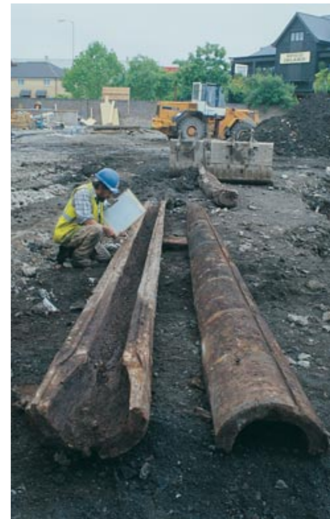
Fig 32 Recording the two halves of an 18th-century ship’s bilge pump, found reused as a drain in Beatson’s shipbreaking yard at 165 Rotherhithe Street