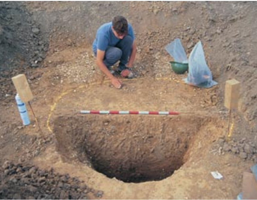
Fig 15 A large, middle Bronze Age pit at Harmondsworth

Age ringforts (eg Carshalton (Adkins and Needham 1985; AGL 2000, Gz ST22, 89,92) and possibly Mayfield Farm (Merriman 1990; AGL 2000, Gz HO18)), and of the few defended enclosures of hillfort type (eg Caesar's Camp (AGL 2000, Gz MT1) and Warren Farm, Romford (AGL 2000, Gz HV1)), remain obscure. In the floodplains there is evidence for rising base levels and correspondingly intensive activity in the form of the construction of wooden trackways (eg Bramcote Green, Bermondsey (Thomas and Rackham 1996; AGL 2000, 87, Gz SW11)). Some of the locally higher sand islands in the Southwark and Bermondsey areas were under plough for short periods in the mid second millennium BC (AGL 2000, 91), and at least one field here had been manured (Drummond-Murray et al 1994, 254).