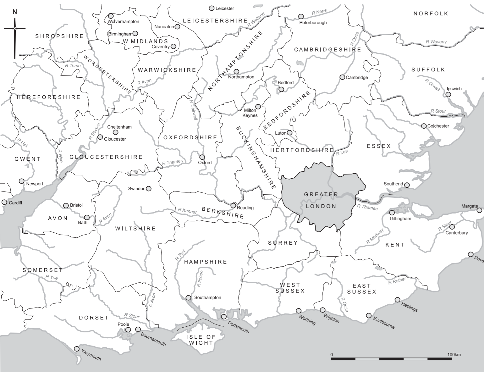
Fig 2 The south-east of England, showing Greater London and the surrounding counties

the City of London west London gravels: the terrace gravels of the Thames in west London around Heathrow airport east London: the low-lying areas north of the Thames in east London; marshlands in later prehistory north Kent: the chalk downlands south of the Thames south-west London: the clays and gravels of north-east Surrey and the Wandle floodplain London: the historic urban core of Westminster, the City and Southwark the city of London: the urban centre of London at any point in time the City of London: the medieval and later City Westminster: medieval Thorney Island and its later development north Southwark: the area of the Roman settlement on the south bank of the River Thames and its later development Fleet Valley, Walbrook Valley, Wandle Valley, Colne Valley, Lea Valley etc: the floodplains of these tributaries of the Thames