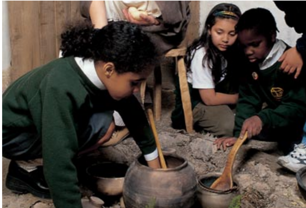
Fig 41 Archaeological research contributes directly to education and public exhibitions such as 'High Street Londinium'

10 popular books and booklets, and nearly 100 journal articles and contributions. The current PCA programme will result in publication of over 35 journal articles and one monograph (Gustav Milne, pers comm). There may well be a similar number of publications being prepared by others, and a 'research audit' is urgently needed. In spite of the nature of contractual agreements in a highly competitive industry, it is desirable to integrate these research programmes into a wider agenda, as discussed below. Publication via web sites and the Internet is now beginning to develop rapidly, and the archives from two major sites, the Royal Opera House and 1 Poultry, will be made available through the Archaeology Data Service (ADS).