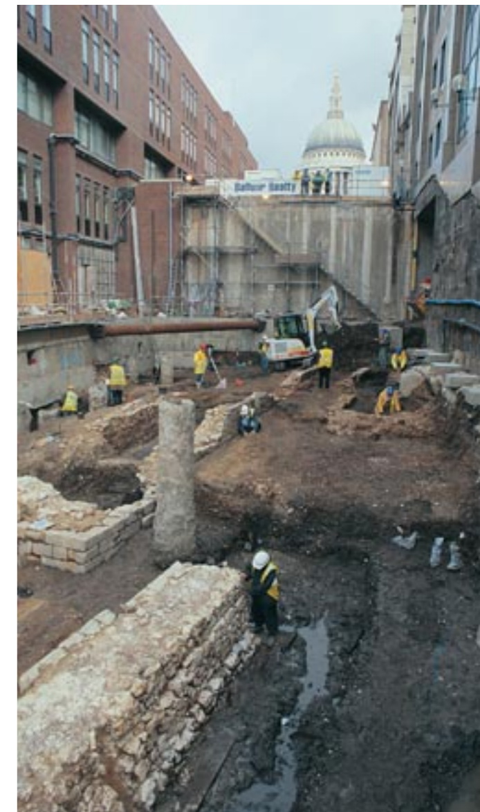
Fig 37 Medieval waterfronts and the Boss Alley inlet, discovered during excavations for the northern abutment of the Millennium Bridge