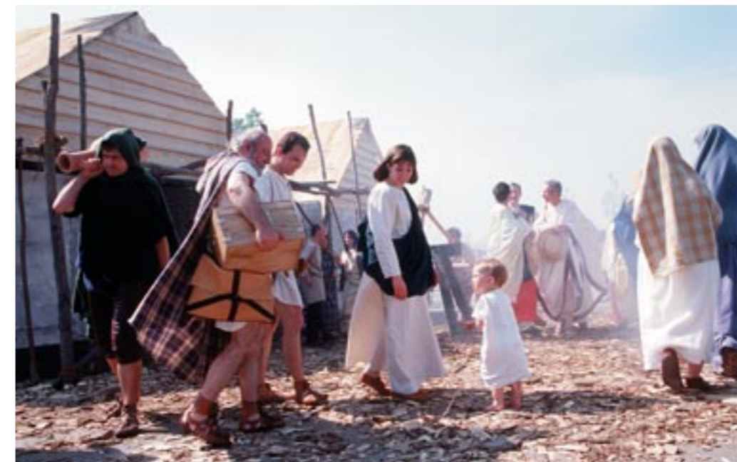
Fig 19 Learning about Roman London's character and identifying its people are topics of interest to the general public and researchers alike; street scene from the Museum of London exhibition 'High Street Londinium' based on findings from 1 Poultry

Direct demographic evidence for Roman London is restricted to cemeteries, with inhumations being the most informative, as demonstrated by the publication of the eastern cemetery (Barber and Bowsher 2000) describing 550 inhumations and 136 cremations. Early Roman burials tend to be cremations, but good-sized assemblages exist for the 2nd–4th centuries. The Great Dover Street cemetery, with 25 inhumations and 5 cremations (Mackinder 2000), and recent work at 1 America Street and Union Street which has uncovered over 80 inhumations, provide important comparanda from Southwark. The western cemetery is represented by antiquarian findings, supplemented by 18 inhumations and 29 cremations from Atlantic House (Watson 2002) and 127 inhumations from Giltspur Street (as yet unpublished). Recent work at Spitalfields, Broadgate and Houndsditch has led to the recovery of over 100 burials from the less well-known northern cemetery which flanked Ermine Street, raising the possibility of worthwhile comparative study with London's other cemeteries (C Thomas, pers comm). A large number of artefacts in museum collections (Barber and Hall 2000) had already testified to a relatively large burial population in the northern cemetery. Isolated graves and small cemeteries have been found elsewhere, and their relationship to settlement patterns and roads remains unclear.