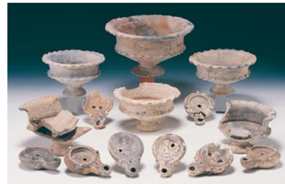
Fig 4 Lamps and tazze forming a cremation group from a 2nd-century AD roadside cemetery at 165 Great Dover Street, Southwark