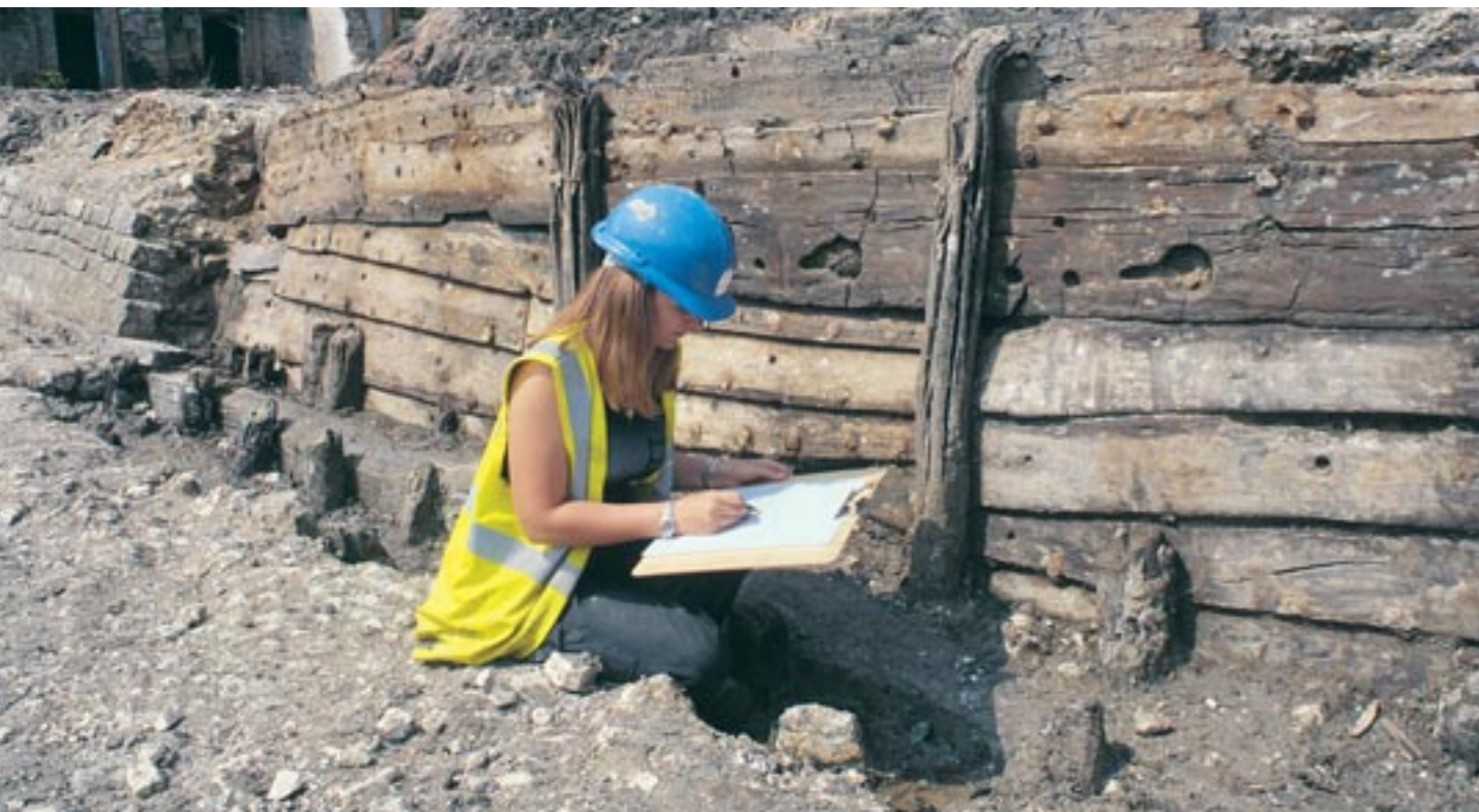
Fig 28 Recording the timbers of a 13th-century rowing galley reused as the lining for a fish pond at More London Bridge in Southwark

the German merchants from the 12th century, might both be expected to have marked effects on the quantity and range of materials passing through the London region. Fairs remained important in the London region, as evidenced by the 13th-century rise of the October fair at Westminster, which only declined in the later 14th century (C Thomas, pers comm).